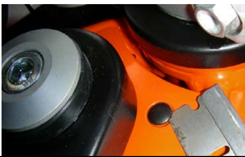
Frame bracket hole, remove plastic covers