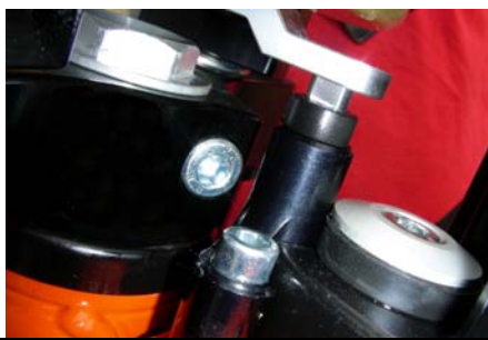
Frame bracket installed-note tower pin height