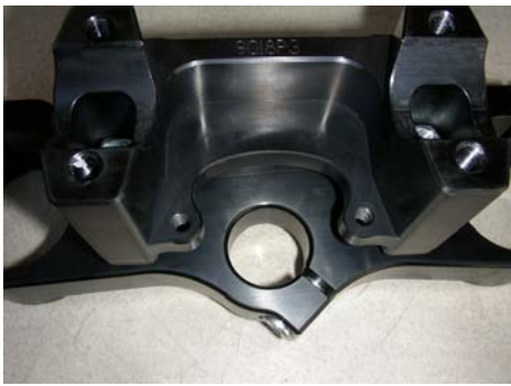
Correct installation of Sub mount