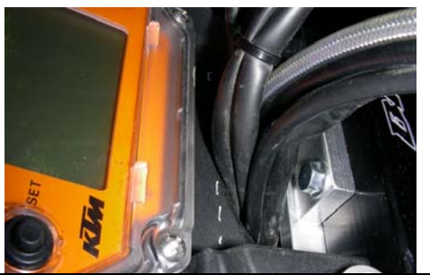
Cables routed properly, no binding