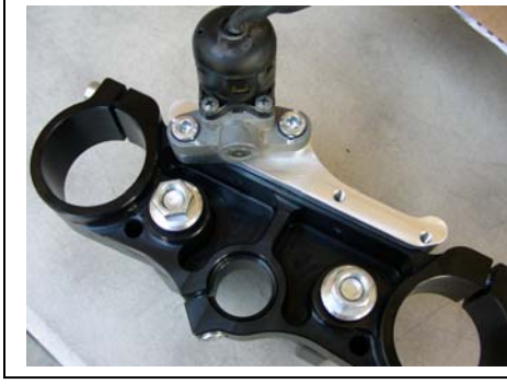
Key switch mounted to underside