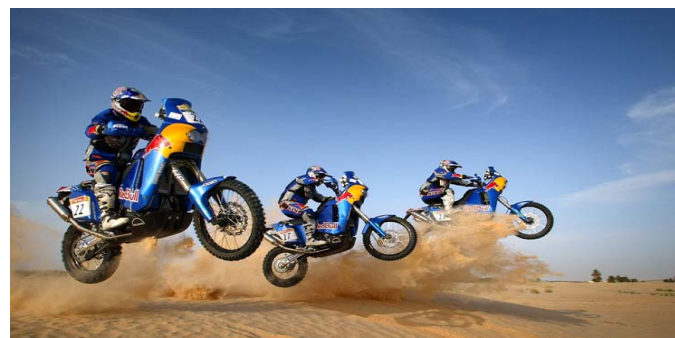
Yes the factory Ktm Dakar bikes use our stabilizer