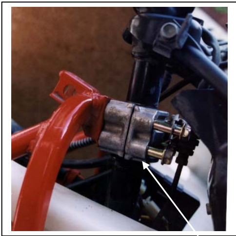
Steering "pillow block"