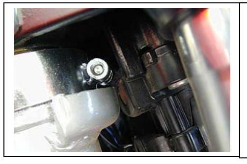
Key lock on XR650L may need slight filing in rare cases. This is under the stock triple clamp on the front side.