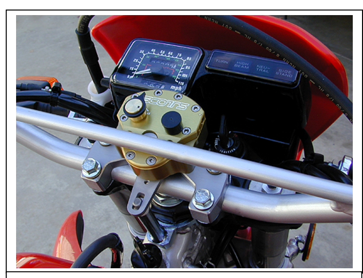
XR650L with stock bars "bowed" and stock key location