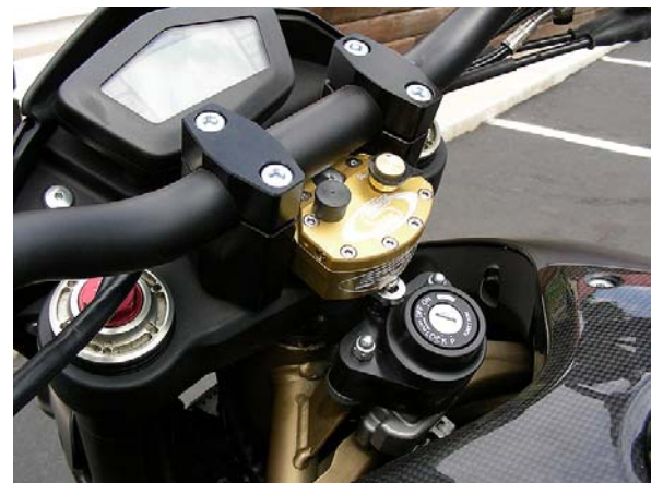
At left is the actual Ducati Factory bike ridden at Pikes Peak by Greg Tracy to an overall win in the 1200cc class. Above is Carlin's carbon fibre covered, black plastic, gold framed HyperMotard jewel.