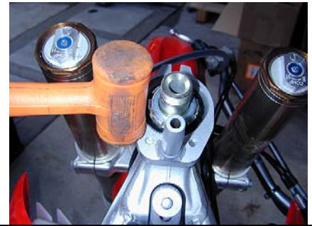
Tap bracket down until securely flush