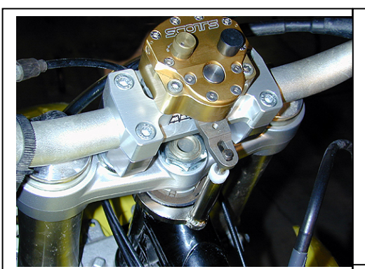
This shows the Oversize bar conversion on the stock triple clamps.