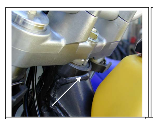
Where you might need to file