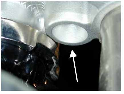
Our aluminum cone must go in the bottom, to clear frame bracket