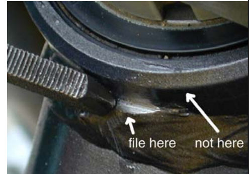
Where to and "not to" file