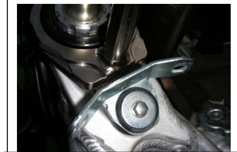
IMS tank bracket installation

Never remove the crossbar! We've removed it for better viewing only.