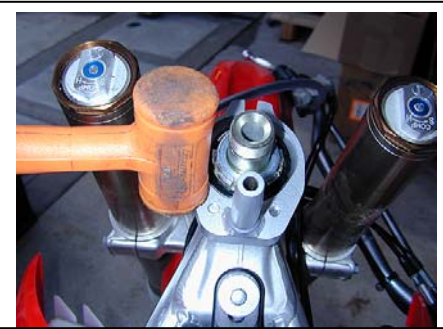
Tap bracket down until securely flush