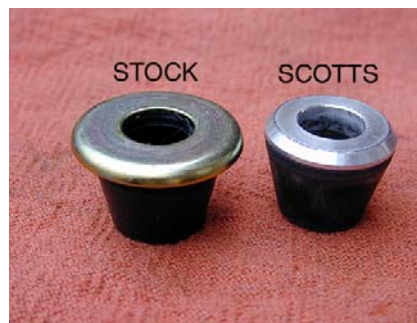
Our replacement cone goes on the bottom And butt the nut directly against the cone.