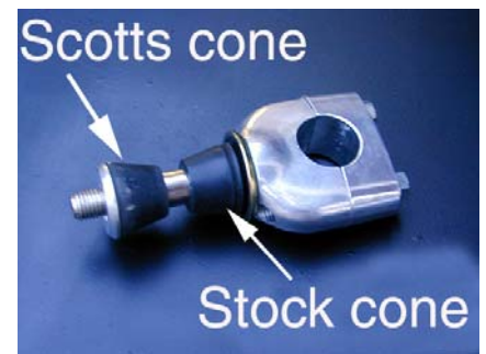
Stock cone on top /Our cone on bottom