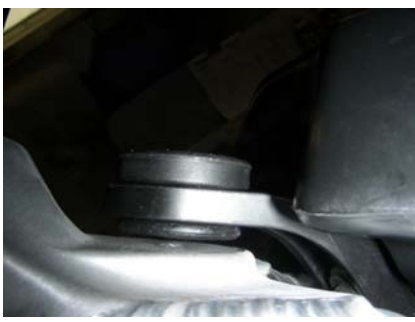
250 only: Invert the tank bushing