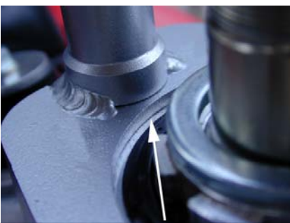
Be sure the frame bracket is all the way down flush with the head tube, all the way around the entire surface.