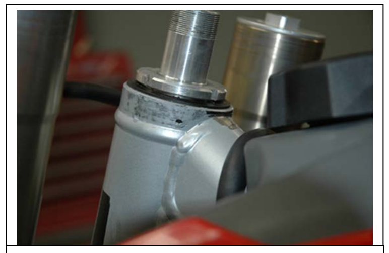
Shown here is some filing at the back of the head tube until the frame bracket is allowed to sit down far enough to clear nuts.