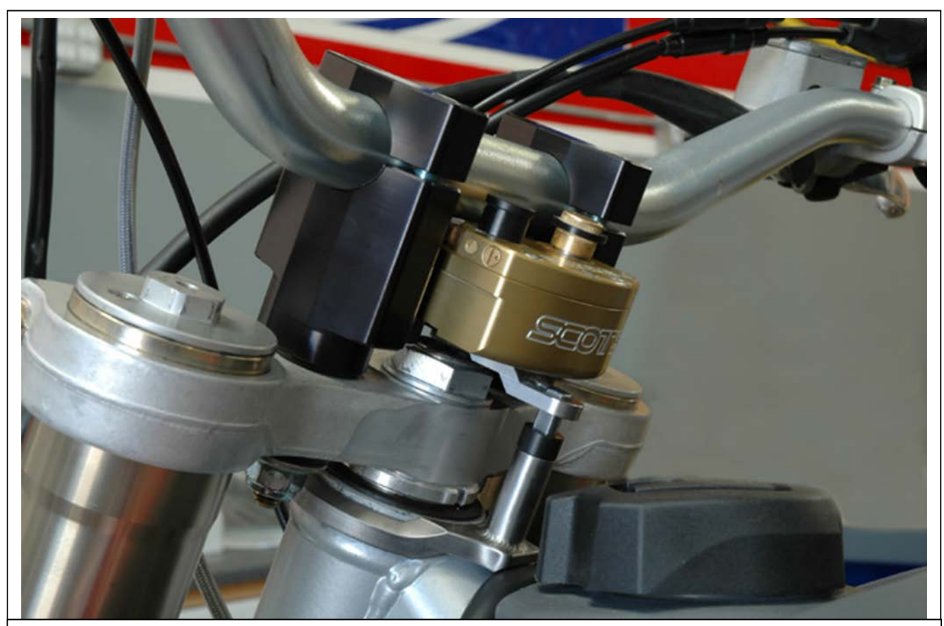
This shows the Sub mount kit complete, mounted on the TE. This is a TE sub mount, the TC looks slightly different.