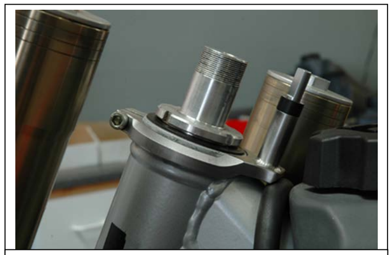
Here is the frame bracket installed, not pinching the radiator hoses and allowing the bracket to clear the nuts on triple clamp.