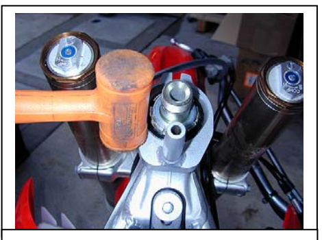
Tap, then tighten, tap and tighten until the bracket is down and securely flush