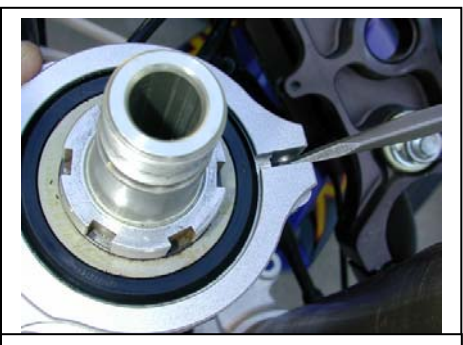
Spread the frame bracket gently and slide it on in one clean motion.