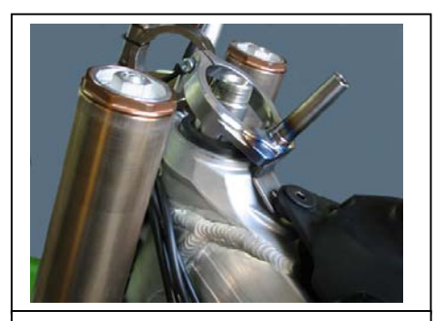
Start by feeding the tab under the gas tank mount or remove the tank.