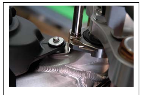
Frame bracket installed with the tower aligned straight on the backbone.