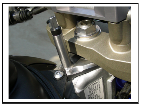
Frame bracket installed correctly