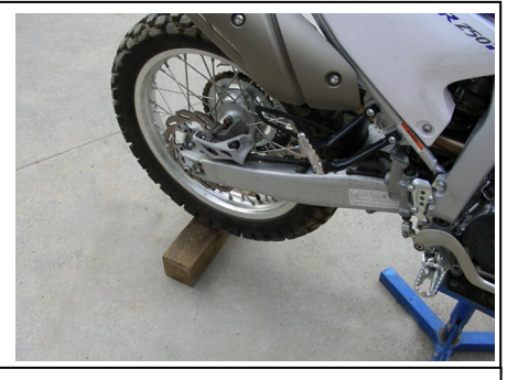
Block the rear wheel also