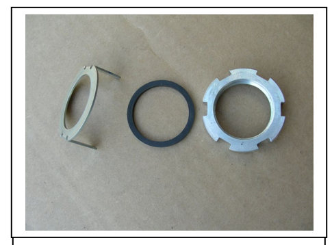
These parts will be discarded