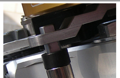
Picture above shows the finished kit using our oversized bar conversion kit.

Left: Shows the correct tower pin height when finished, adjusted so the linkarm is in the middle of the flats on the tower pin. The black collar can be easily moved up or down on the tower pin to achieve this setting.