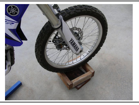
Block the front wheel securely!