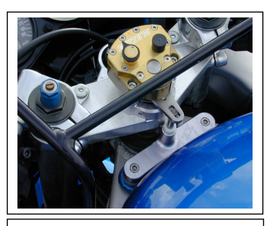
This "standard" style mounting requires the key to be modified in order for the key to clear the stabilizer upon insertion.

Typical Key Mod requires trimming one corner slightly.