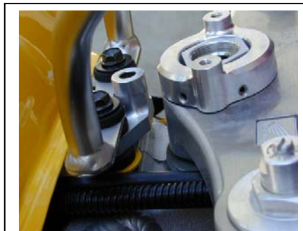
Frame bracket location