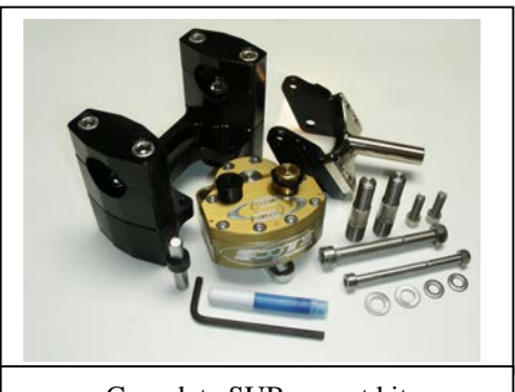
Complete SUB mount kit

1. Step by step instructions. Be sure to read the text that accompanies these photos there is a specific order.