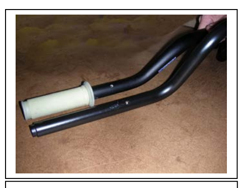
Drill the bars 3/16" to retain controls