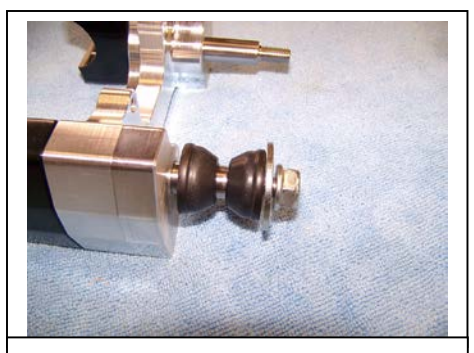
This is how the rubber cones will end up after installation.