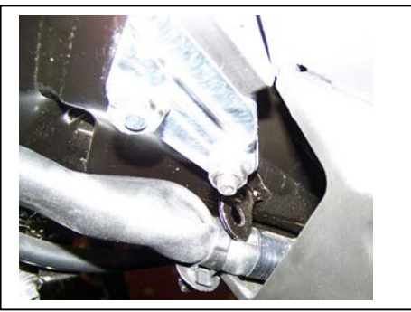
Wire loom routed below bracket