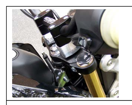
Mounting kit installed complete