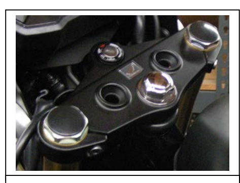
Remove the handlebar mounts