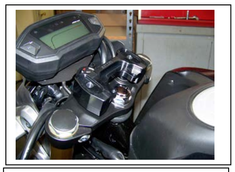
This shows the sub assembly in black installed on the triple clamp