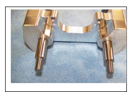
Sub assembly with studs