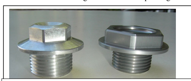
The stock 2015 stem nut shown at left.... Use Scotts Replacement nut shown @ right for 2015-on rubber SUBs