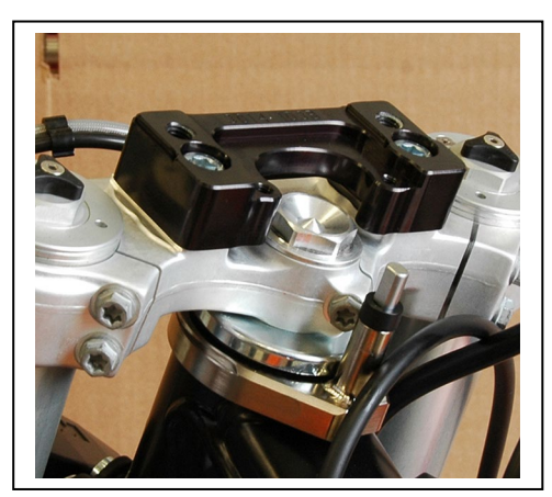
Bolt the SUB mount to the triple clamp, Using the Allen bolts provided.