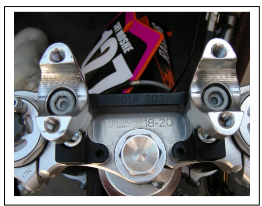
Note how the damper mounting holes are over the center line of the steering stem.