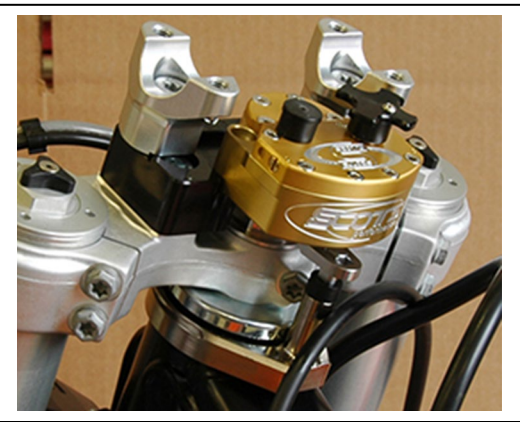
Bolt the stock barclamps to the Sub mount, Using the stock Ktm Allen bolts.