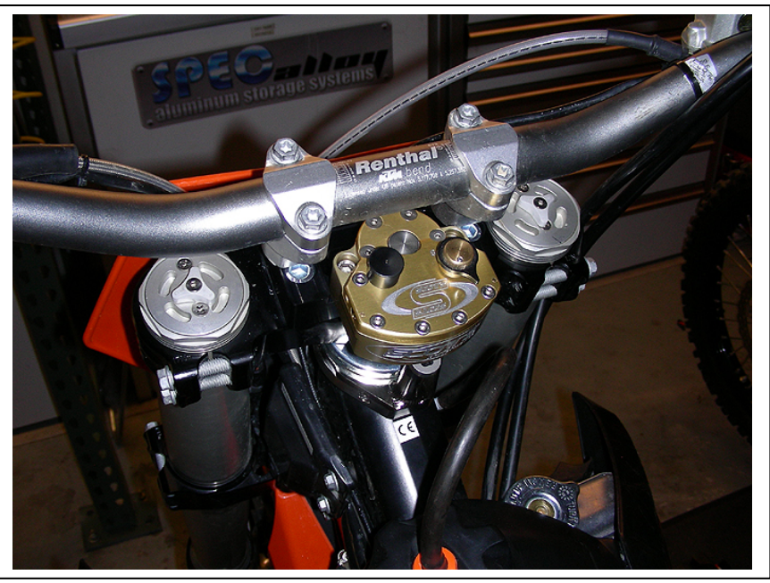
Ktm/Husky Sub Mount / SUB-5926-STK