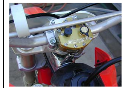
Reversed mount stabilizer shown