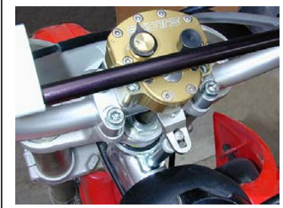
Standard mount stabilizer shown

This photo is for reference only to show the barclamp installed. This is not a photo of the CR80/85 but the concept is accurate.