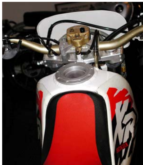
10 time Winner Johnny Campbell Team Honda's Baja 1000 Race bike

This photo shows the molded cable guide we offer to help guide the cables using the IMS tank. Exceptionally tall or wide bars will stretch the cables too far. For applications where the cables are too short you must purchase longer cables.