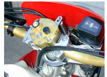
Optional “Forward mount kit” shown with Speedo relocation bracket and Scotts Billet Triple clamp kit.