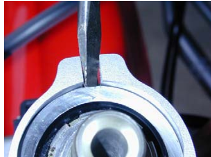
Remove bolt & spread bracket to install