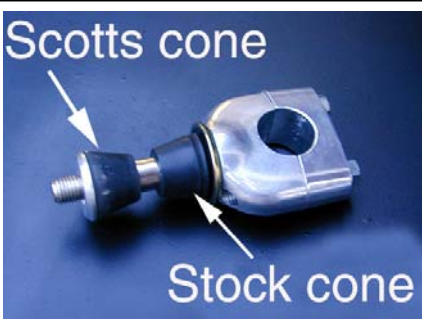
This shows the stock mounting perch