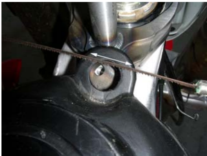
This shows where to approximately cut the nose on the stock tank in order for it to clear the frame bracket.