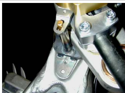
This shows just how close the stock triple clamp is to the vertical tower. Align so both sides are equal and yet the steering stops still make contact.