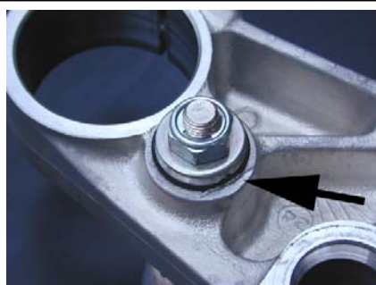
Some bikes will need filing here