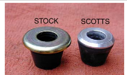
Our replacement cone goes on the bottom