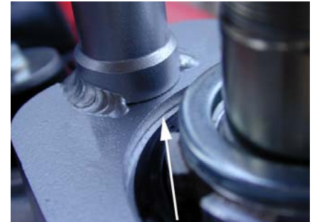
Be sure the frame bracket is all the way down flush with the head tube, all the way around the entire surface.