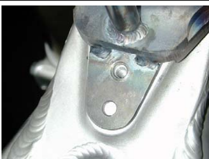
This shows the alignment of the frame bracket after the front pinch bolt has been properly tightened. The forward hole is for the X models and the rear hole fits the CRF250R models.