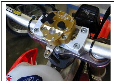
Oversize bars with IMS tank