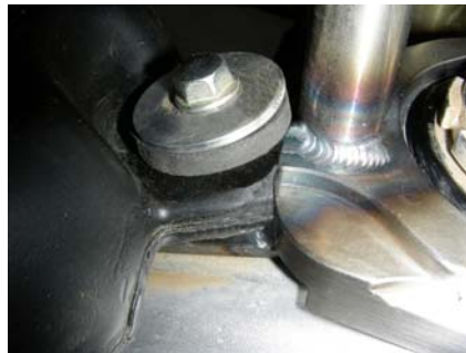
Cut nose of tank until fit is achieved. Leave as much of the hole to help retain the rubber grommet in place.