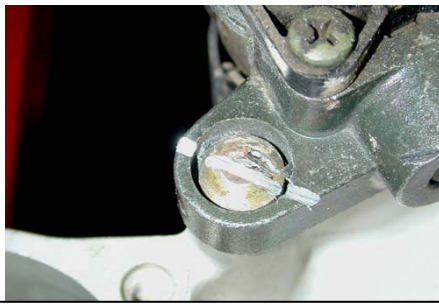
Or Cut a slot in the head for screwdriver