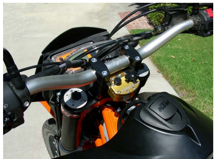
The large knob pictured in this photo is an optional part.