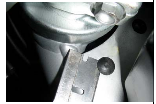
Remove plastic covers to expose bkt holes