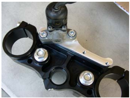
Key switch mounted to underside