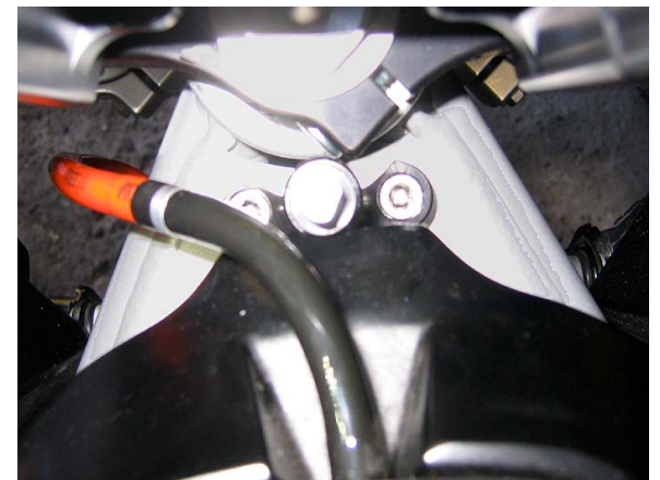
Finished bracket with radius toward the front of bike