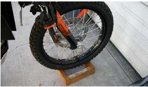
Block the front wheel securely