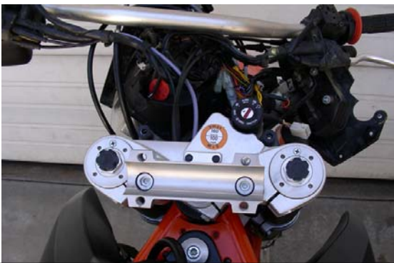
Roll the bars up out of the way and tie up.

Or, use a Tie down around the front axle, up and over the frame and back to the underside of the lower triple clamp to hold the forks on.