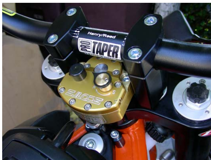
This depicts the finished kit but may not be your exact model.