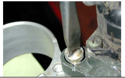
Hand impact driver or good slot head