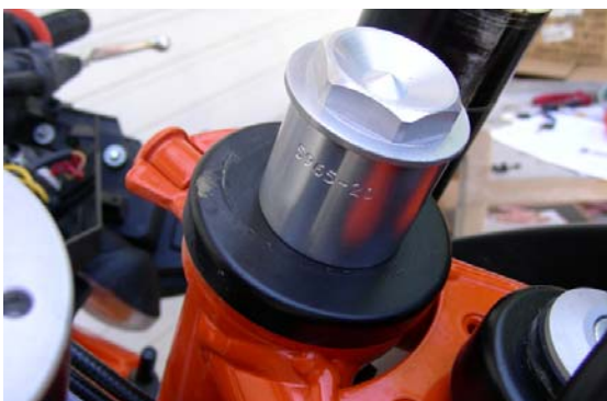
Tool to hold forks on while working with TC off.