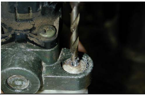
Drill a hole dead center for an easy out or..