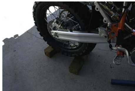
Block up the rear to put pressure on front