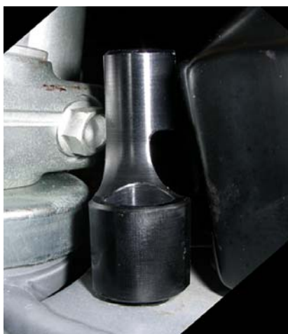
Fit the Frame bracket both ways to see which fits your bike best / they vary.