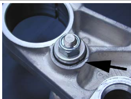
Not on all bikes / only a few need this