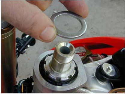
Install special .125" washer supplied

1. Step by step instructions. Be sure to read the text that accompanies these photos there is a specific order.