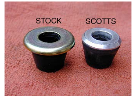
Use our replacement cones on the bottom