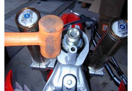
Tap bracket down until securely flush