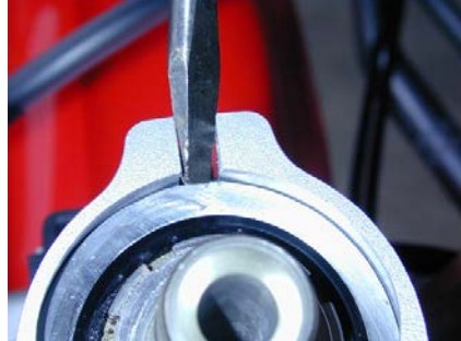
Remove bolt & spread bracket to install