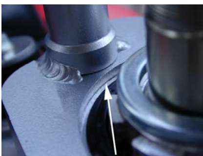
Be sure the frame bracket is all the way down flush with the head tube, all the way around the entire surface.