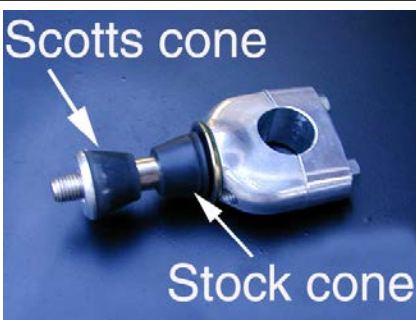
This shows the stock mounting perch