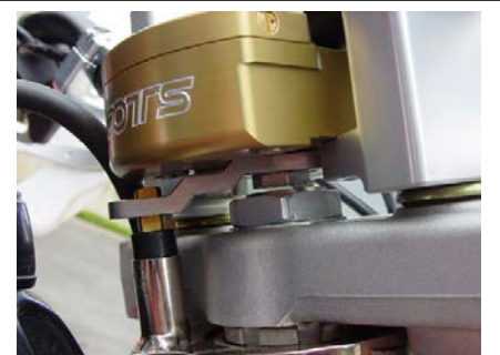
Shows correct tower pin height