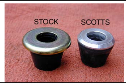
Use our replacement cone on the bottom