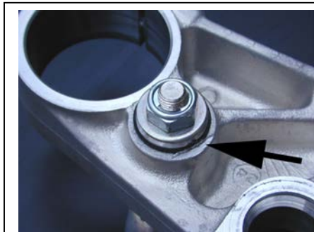
Not on all bikes / only a few need this