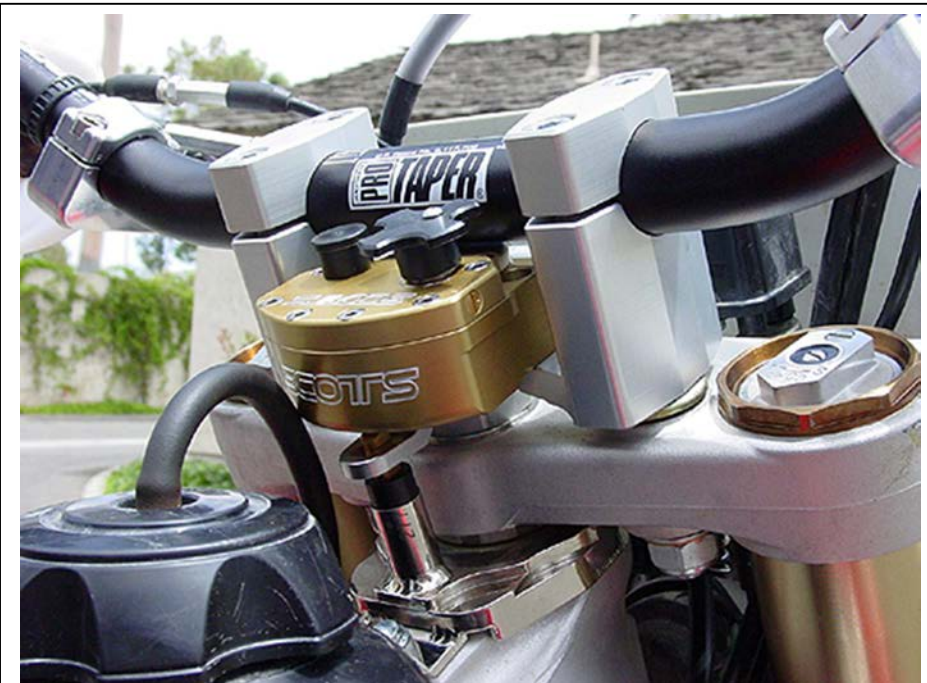
Finished SUB mount / (Large knob in photo is optional).