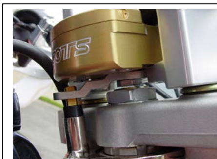
Shows correct tower pin height