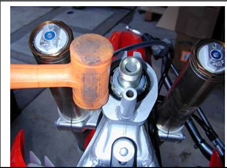
Tap bracket down until securely flush