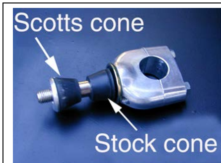
This shows the stock mounting perch