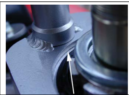
Be sure the frame bracket is all the way down flush with the head tube, all the way around the entire surface.