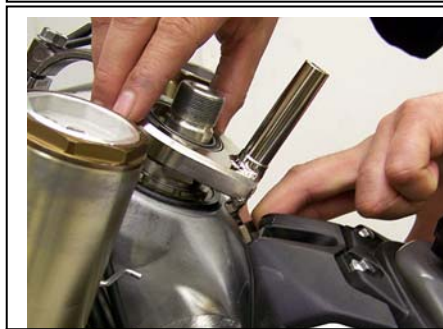
Frame bracket rotates so the tab slides in under the tank bracket mount.