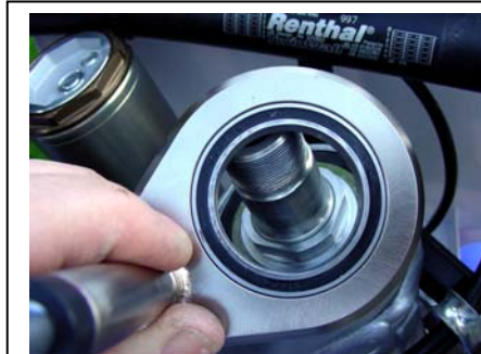
Install the frame bracket and bearing over the special nut.