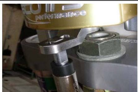
Left: Shows the correct tower pin height when finished, adjusted so the tower pin should be flush with top of link-arm. The black collar can be easily moved up or down on the tower pin to achieve this setting.