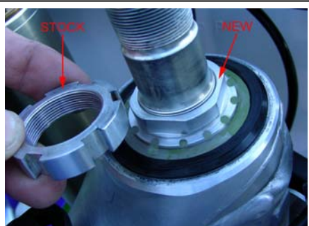
Castle nut removed / new nut installed