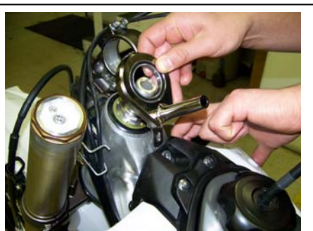
Slide the frame bracket over the special nut with tank tab off to side.