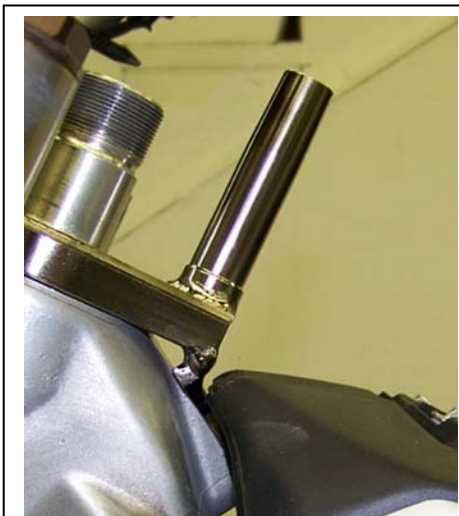
Tab should fit perfectly under tank