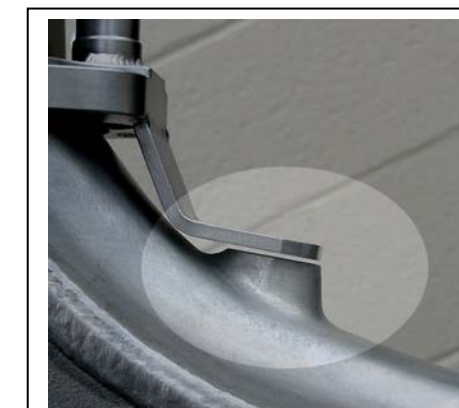
If our frame bracket tab is too high or too low, shim using washer, or file the frame lug a little, until the tab just slides in. Do not try to bend the tab!