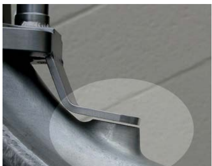
If the frame bracket tab is too low or too high do not try to bend it. Shim it or file the aluminum frame lug a little.