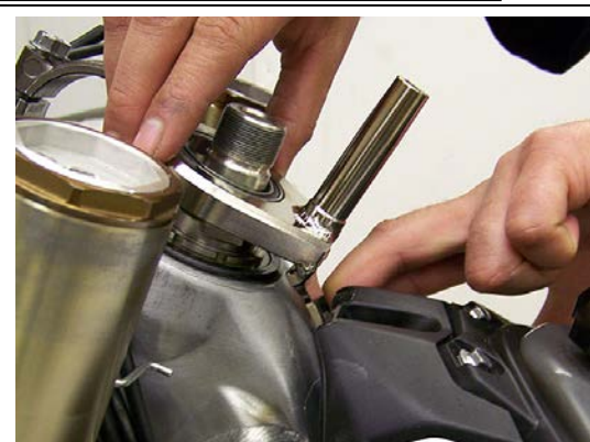
Frame bracket rotates so the tab slides in under the tank bracket mount.