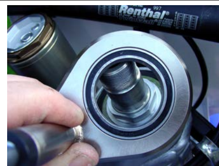
Install the frame bracket and bearing over the new special nut.