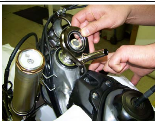
Slide the frame bracket over the special nut with tank tab off to side.