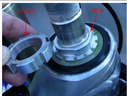
Castle nut off / new nut on / Maintain the same tension on the bearing