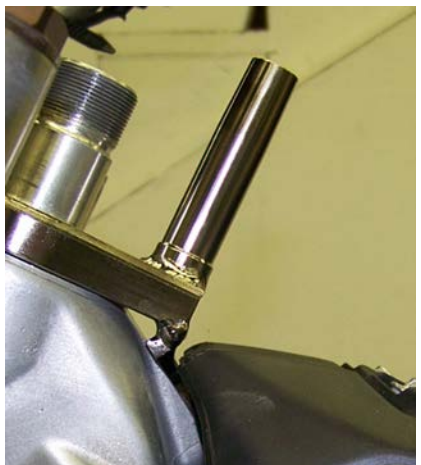
Tab should fit perfectly under tank mount and just slide in over the aluminum frame lug.