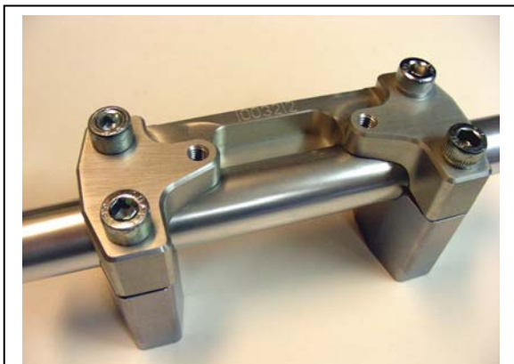
Mark and cut the tower so the flats are in the middle of the linkarm.