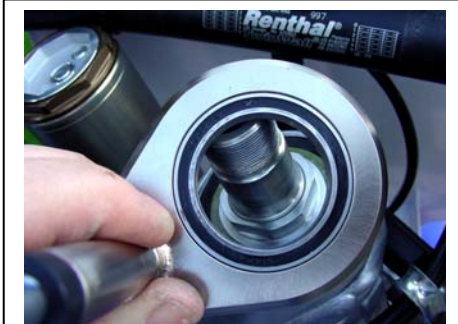
Install the frame bracket and bearing over the new special nut.