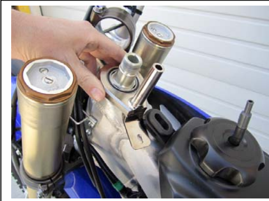
Slide the frame bracket over the special nut with tank tab off to side.