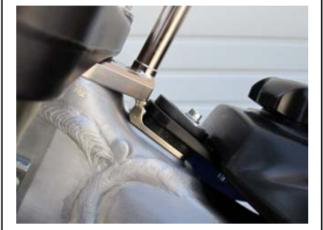
If the frame bracket tab is too low or too high do not try to bend it. Shim it or file the aluminum frame lug a little.