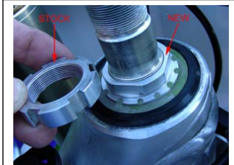
Castle nut off / new nut on / Maintain the same tension on the bearing