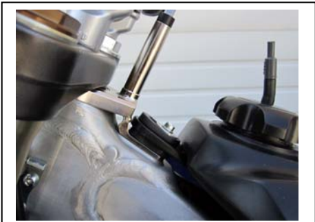
Tab should fit perfectly under tank mount and just slide in over the aluminum frame lug.