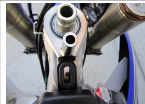
Frame bracket rotates so the tab slides in under the tank bracket mount. Align the hole.