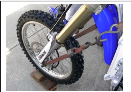
Block the front wheel securely!