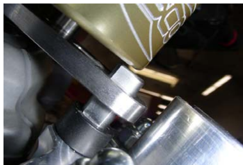
This shows the incorrect tower pin height.