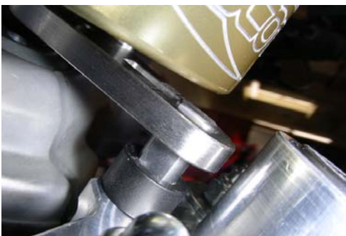
This shows the correct tower pin height