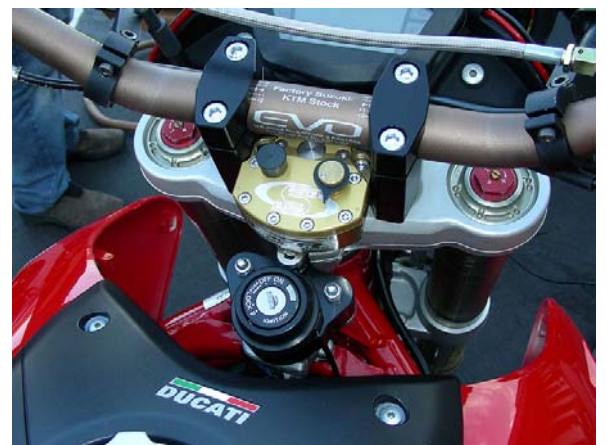
Above is a photo of the actual bike that was prepared by the Ducati Factory and ridden at Pikes Peak by Greg Tracy to an overall win in the 1200cc class and only seconds off the best time ever up the mountain.