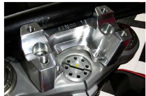
This shows the SUB mount only installed