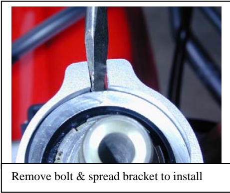
Remove bolt & spread bracket to install