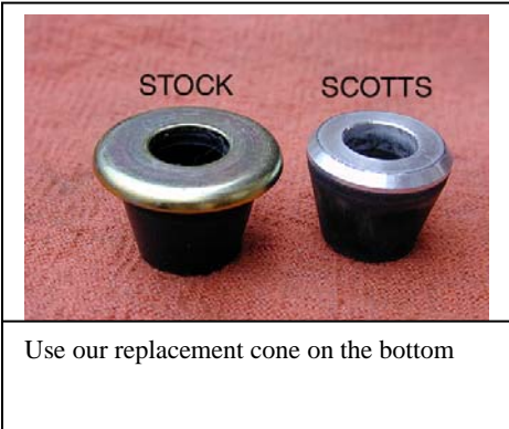
Use our replacement cone on the bottom