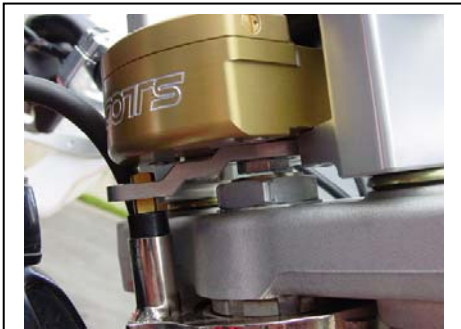
Shows correct tower pin height