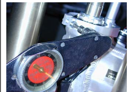
Torque the frame bracket pinch bolt to at least 96-108 inch lbs., or the equivalent of 8-9 foot lbs.