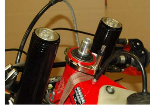
Remove the jam nut and seal cover. Then install the frame bracket