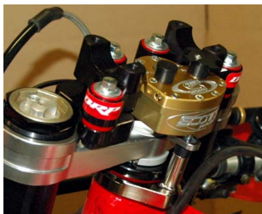
After making sure the tower pin does not hit the bottom of the stabilizer body, install the stabilizer to the sub mount using the bolts provided.