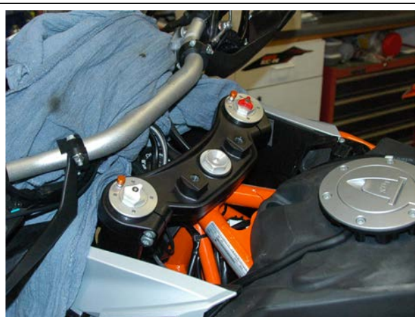
Remove seat, tank and lay bars forward out of the way