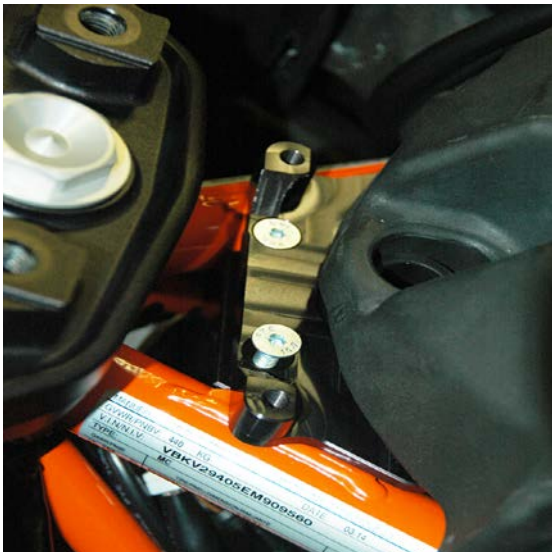
Install the (2) 6x25 flat head Allen bolts so the upper and lower plate align to the frame. Do not tighten until all tank bolts line-up.