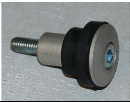
Remove the tank bolt, rubber grommet and aluminum guide