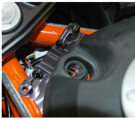
Install the upper half of the frame plate by sliding it under the tank but under remaining lower 1/2 rubber grommet