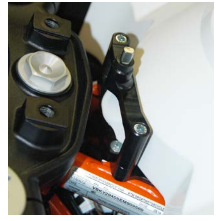
Tower Bridge installed correctly. Tower pin should be centered in link-arm when stabilizer is installed.