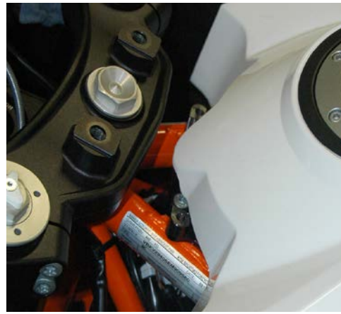
Reinstall the tank cowling, with the front tabs first. You need to squeeze cowling a bit to allow it to fit past the two bosses on tower base plate. Since the bracket under the tank raises the tank slightly, the cowling bolts and plastic latches need a little coaxing in order to line up.