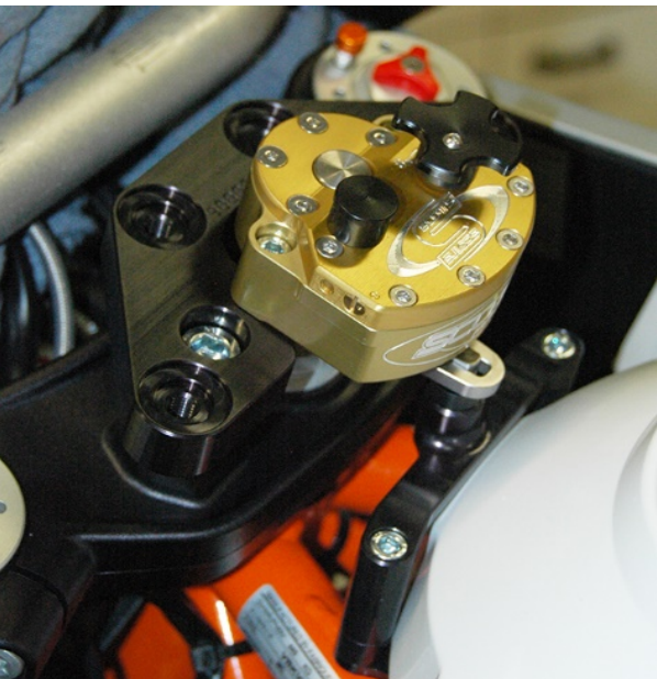
This shows the SUB mount assembly installed to the triple clamp and then the stabilizer mounted to the SUB mount assembly with the tower pin greased and in the center of the slot of the link-arm.