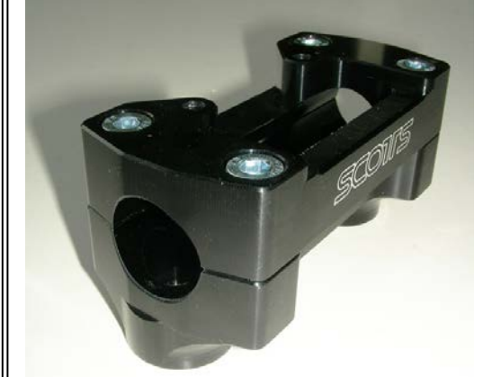
This shows the new one piece HD Scotts lower cradle and Barclamp to replace the rather weak stock unit that bends easily with simple tip overs.