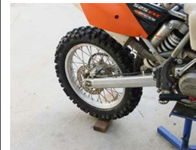
Block the rear wheel also, pushing pressure on the front end to hold the forks tightly in place.