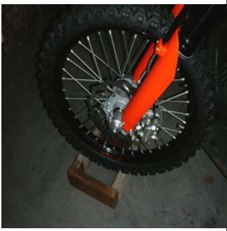
Block the front wheel & forks