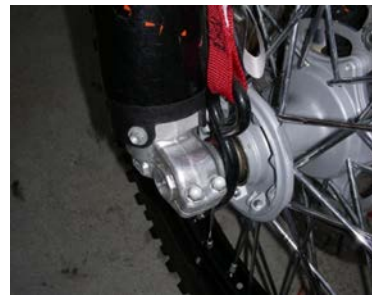
Run a tie down from the front axle up and over the backbone to the other side axle.