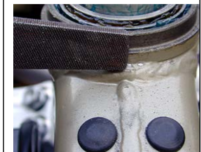
Using a sharp file, start at the high spots and trial fit the bracket until it fits.