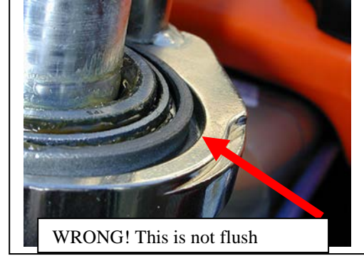
WRONG! This is not flush