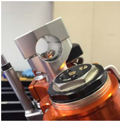
Shown here is the lower Barclamp cradle with the bars in the Forward position. You must tighten the front bolts first, so the Barclamp butts down tightly.