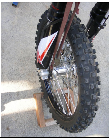
Block the front wheel & forks Or use tie downs to hold em.