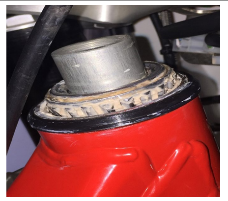
File welds keeping the frame bracket from clamping tightly around head tube