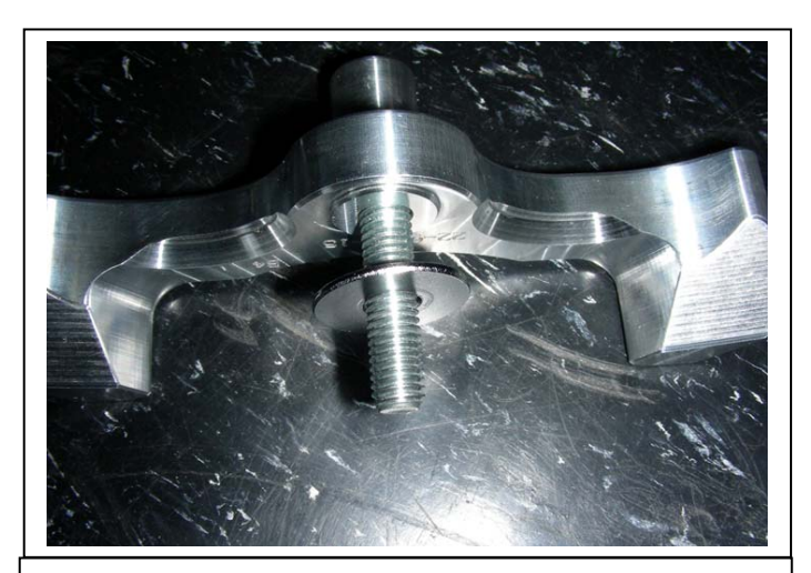
In some cases you may need the stock tank washer.