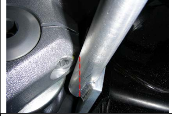
May need trimming here to clear triple clamp