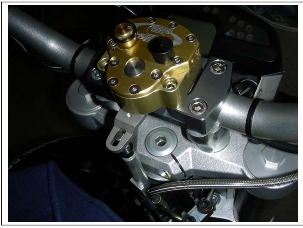
Weld on instructions 12/06/11 BMW G650X 4554-10