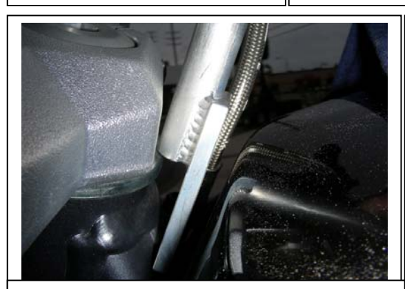
Move the weld on tower around to find best spot.