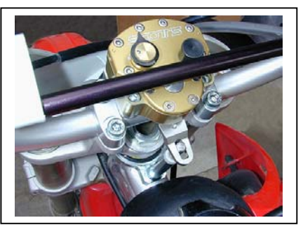
Standard mount stabilizer shown