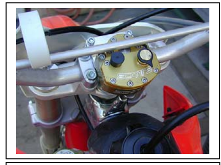
Reversed mount stabilizer shown