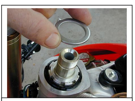
Install special .125" washer supplied