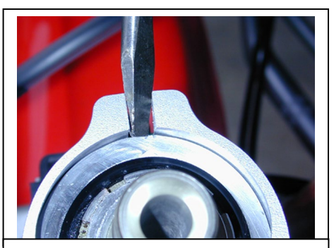
Remove bolt & spread bracket to install