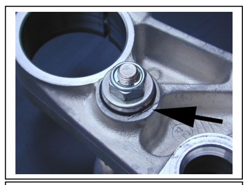
Not on all bikes / only a few need this