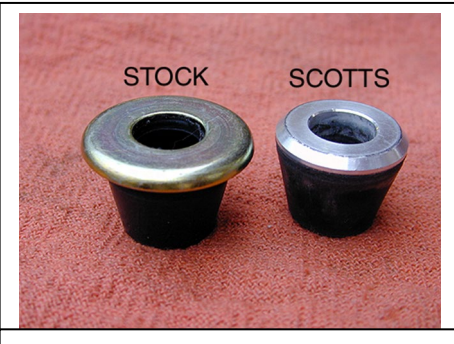
Use our replacement cones on the bottom