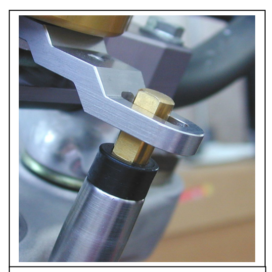
Best to have to the linkarm in the middle of the flats on the tower pin on this model.