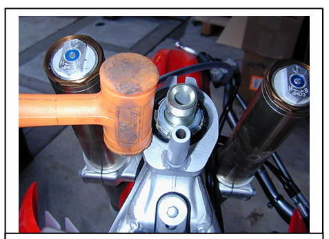
Tap & tighten, tap & tighten until the bracket is down flush all the way around the entire head tube.