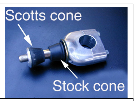
This shows the stock mounting perch