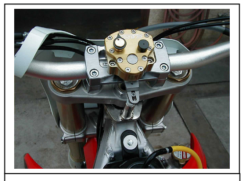
Oversize bars with stock triple clamp