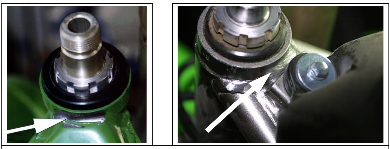
The welds vary considerably from bike to bike so be sure to file downward until the bracket fits properly retaining the head tube sizing