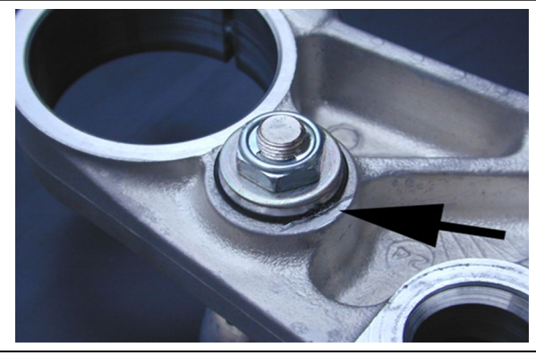
Photo at left shows the occasional mod required to some triple clamps in order to clear frame bracket.