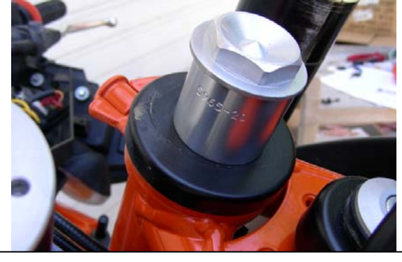
Tool to hold forks on while working with TC off.

Or, use a Tie down around the front axle, up and over the frame and back to the underside of the lower triple clamp to hold the forks on.