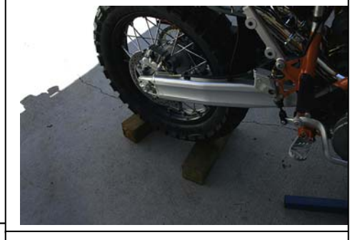
Block up the rear to put pressure on front