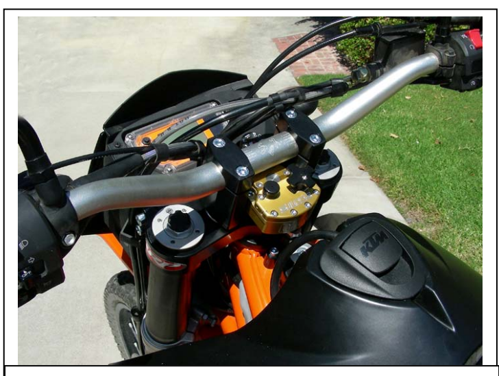
The large knob pictured in this photo is an optional part.