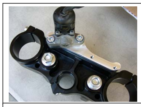
Key switch mounted to underside