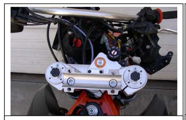
Roll the bars up out of the way and tie up.