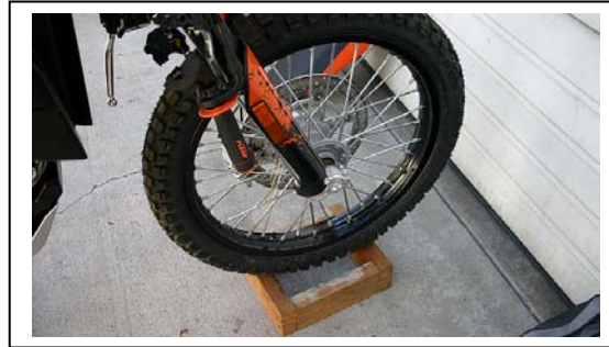
Block the front wheel securely