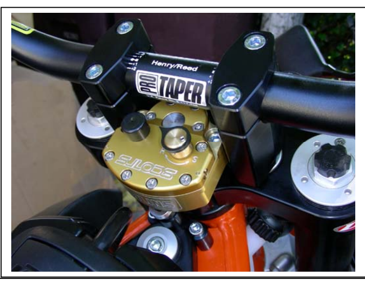
This depicts the finished kit but may not be your exact model.

Finished bracket with radius toward the front of bike