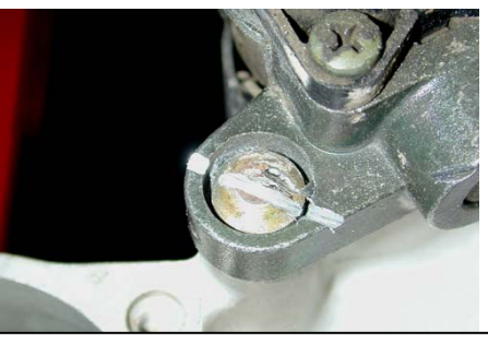
Or Cut a slot in the head for screwdriver

Drill a hole dead center for an easy out or ..