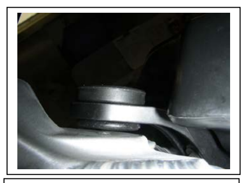
250 ONLY: you must invert the stock Tank bushing so the thin side is down And install 3mm washer under tab.