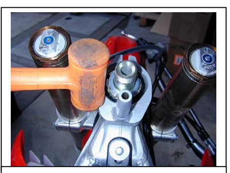
Tap, then tighten, tap and tighten until the bracket is down and securely flush