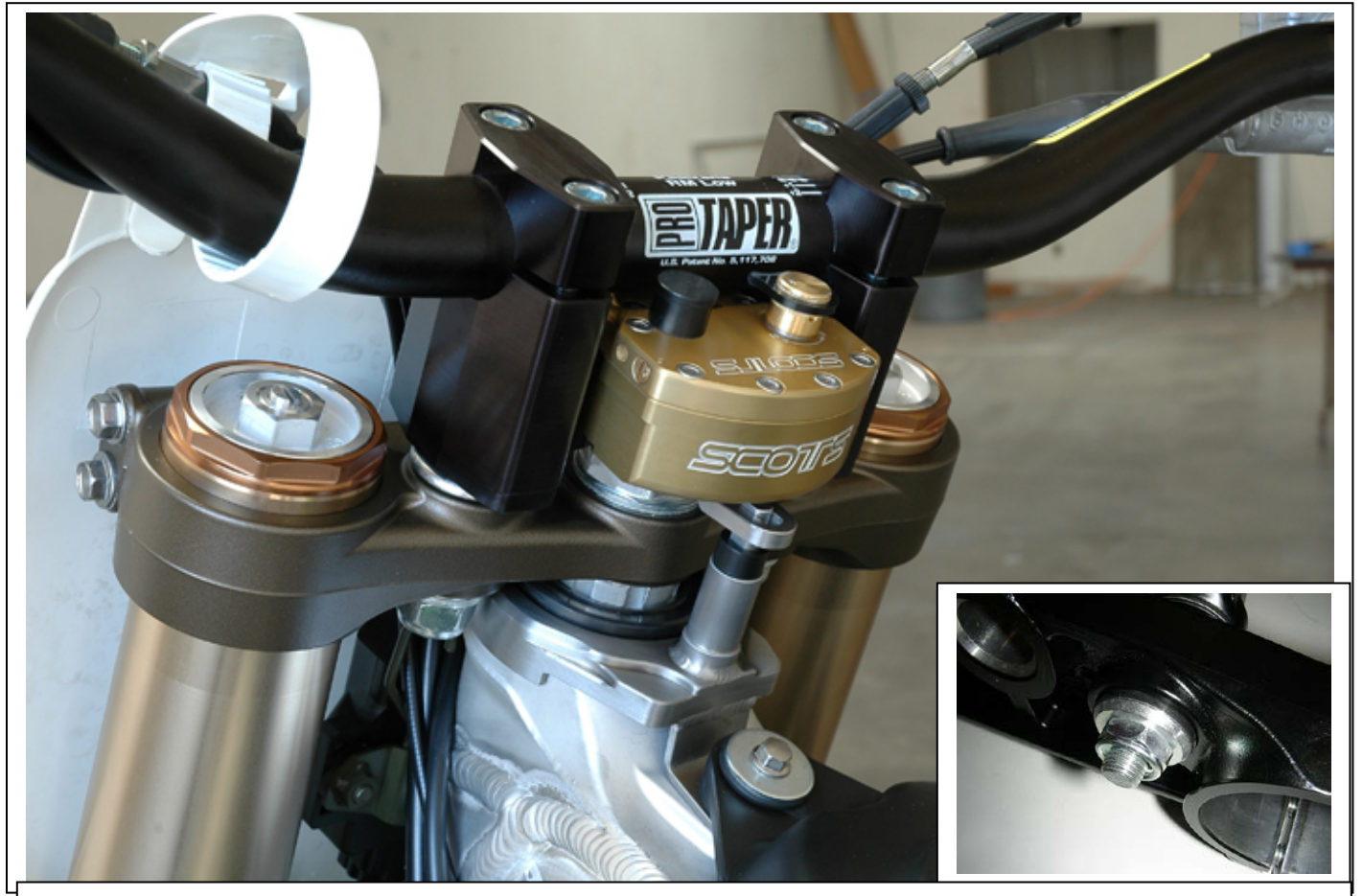
Note the correct height of the tower pin / Inset picture shows the new lower cone installed on the bottom of the triple clamp