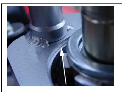
Be sure the frame bracket is <u>all the</u> <u>way down</u> flush with the head tube, all the way around the entire surface.