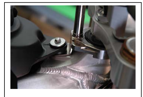
Frame bracket installed with the tower aligned straight on the backbone.