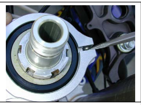
Spread the frame bracket gently and slide it on in one clean motion.