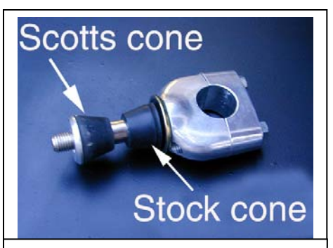
This shows the stock mounting perch