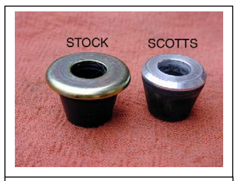
Use our optional replacement cones on the bottom in cases where clearance is an issue. Stock triple clamps don't need this.