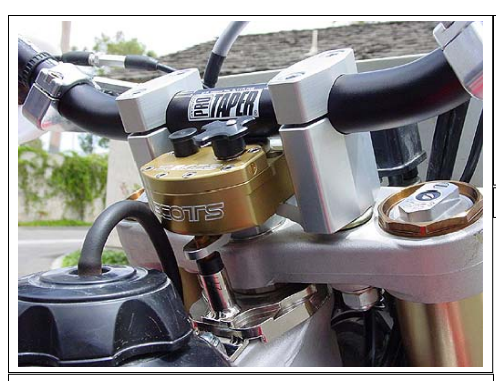
Finished SUB mount shown here on the CRF250X.