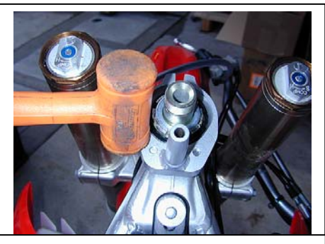
Tap bracket down until securely flush