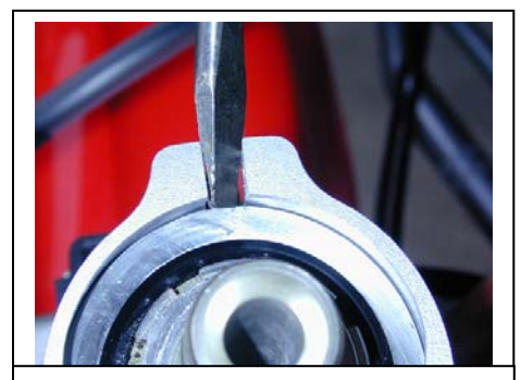
Remove bolt & spread bracket to install