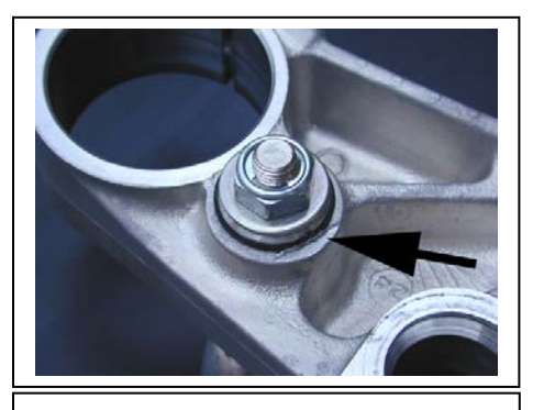
Not on all bikes / only a few need this