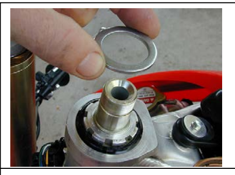
Install special .125" washer supplied

1. Step by step instructions. Be sure to read the text that accompanies these photos there is a specific order.