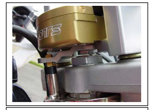
Shows correct tower pin height