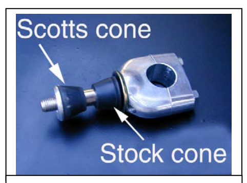
This shows the stock mounting perch