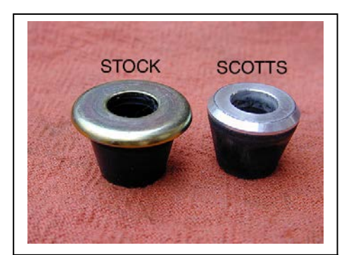
Use our replacement cones on the bottom