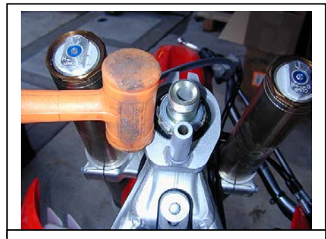
Tap bracket down until securely flush