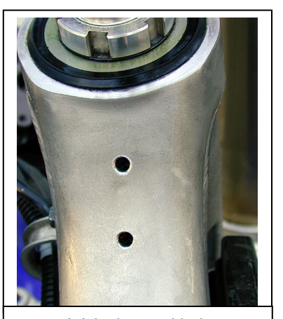
Finished tapped holes