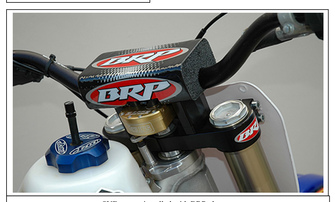
SUB mount installed with BRP clamps.