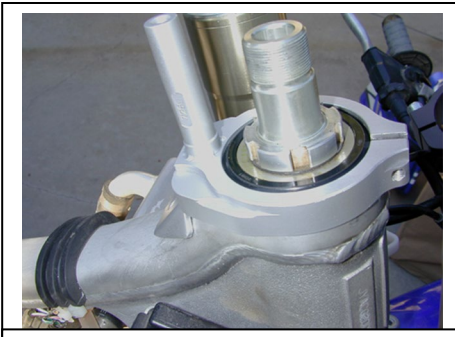
Frame bracket installed with the tower aligned straight on the backbone.