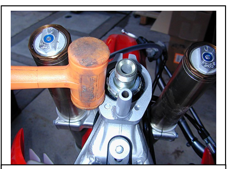
Tap, then tighten, tap and tighten until the bracket is down and securely flush