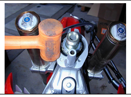
Tap, then tighten, tap and tighten until the bracket is down and securely flush