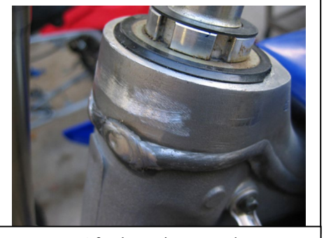
After bump is removed