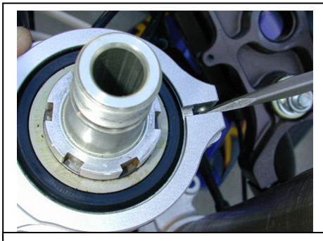
Spread the frame bracket gently and slide it on in one clean motion.