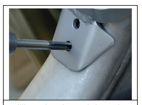
Drilling and tapping one hole at a time. Keep the drill and tap perpendicular to the bracket tab surface.