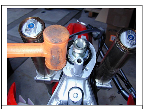
Tap, then tighten, tap and tighten until the bracket is down and securely flush