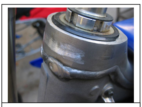
After bump is removed