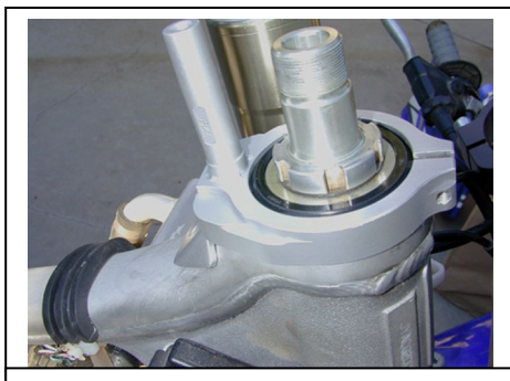
Frame bracket installed with the tower aligned straight on the backbone.