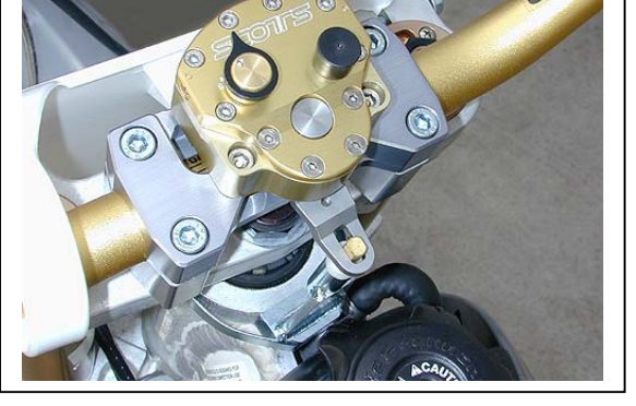
annondale C440, E440, X440, MX400 instructions / 03/17/03 7067 & 7767