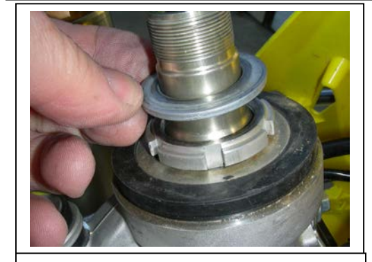
Put the stem spacer here on top of jam nut