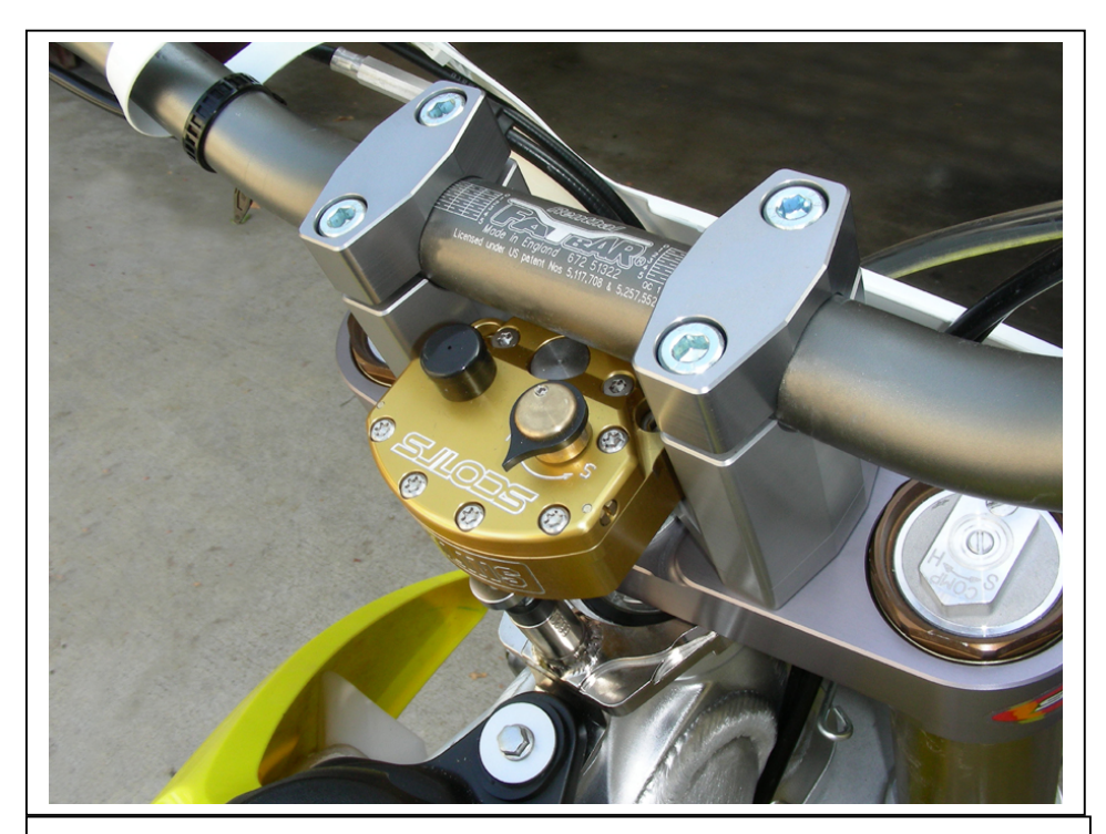
Finished SUB Mount shown with Scotts Triple Clamp- may not be your exact model