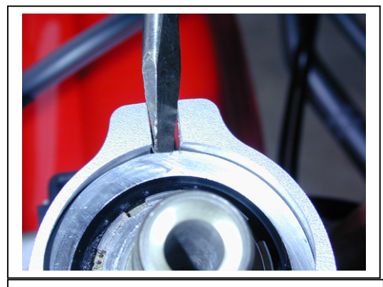
Spread the bracket gently, only enough to allow it to slide over the head tube.