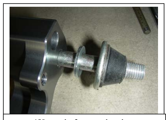
450: put the 2mm washers here