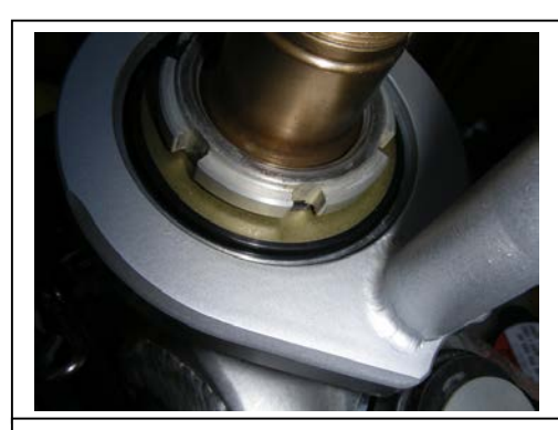
The frame bracket must down flush, all the way around on the top of the head tube. Note new seal is installed.