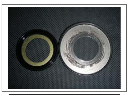
Our Seal on the left. stock seal on the right. Must use our style seal with our kit to allow frame bracket to fit.