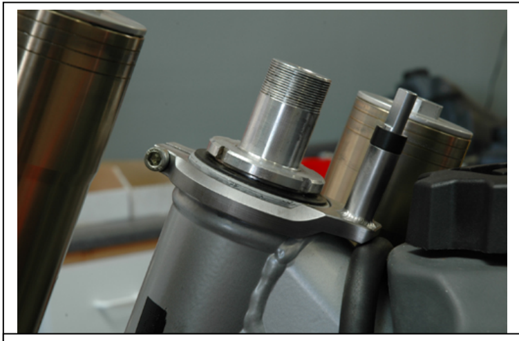
Here is the frame bracket installed, with it low enough to clear the bolt heads on the bottom side of the triple clamp.