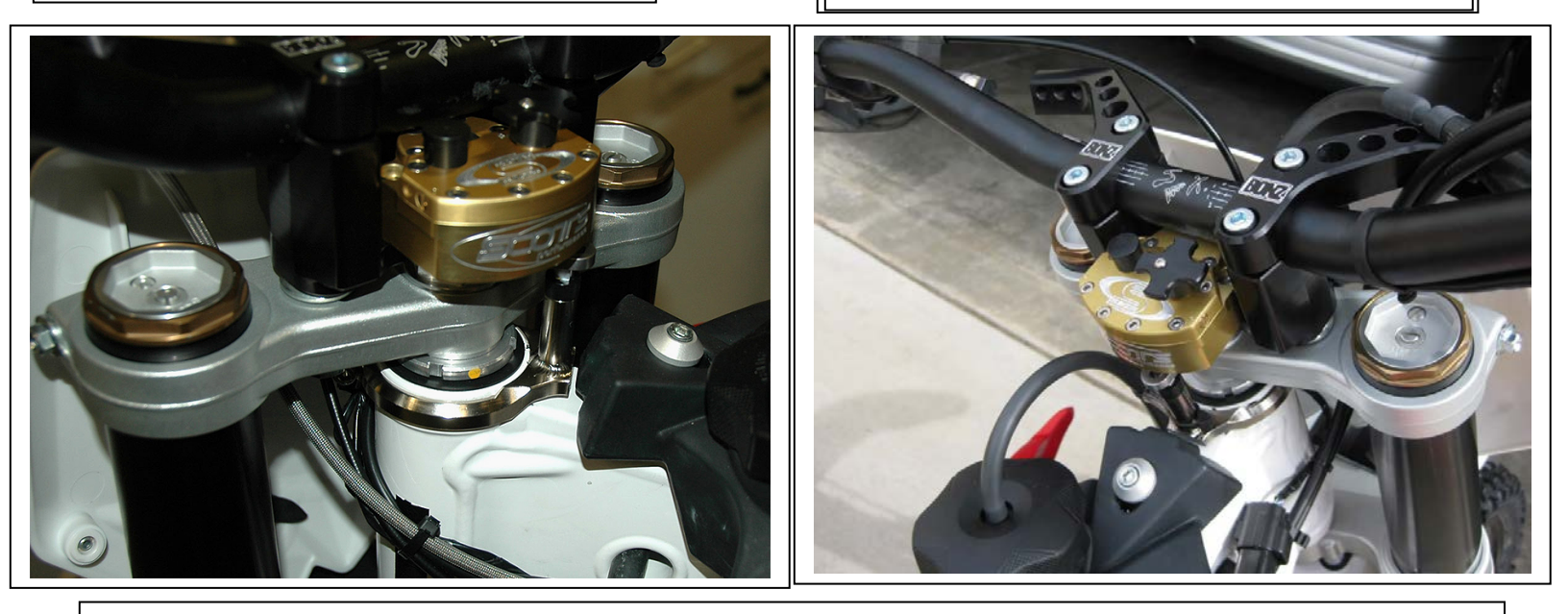
This shows the finished SUB Mount kit complete. (The large black knob shown is an extra option).