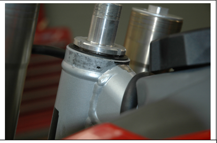
Shown here is some filing at the back of the head tube until the frame bracket is allowed to sit down far enough to clear nuts.