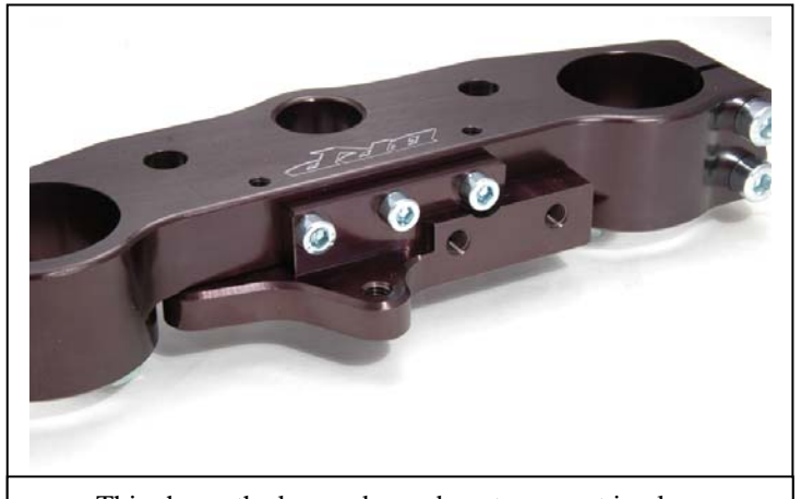
This shows the key and speedometer mount in place