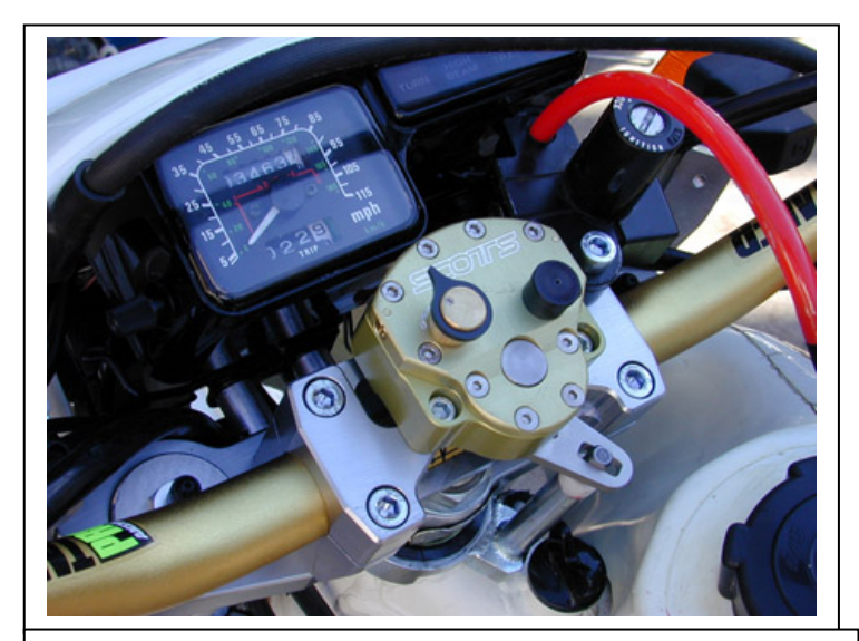
XR650L with Oversize bars, Scotts Triple Clamp & key relocated