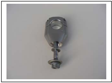
Remove the stock lower bar mounts