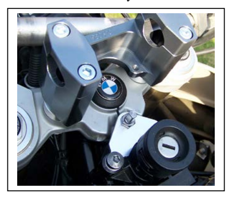
This shows correct tower height, do not allow pin to contact damper.