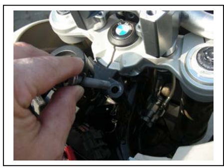
Stock key switch bolts are Torx remove and install frame bracket