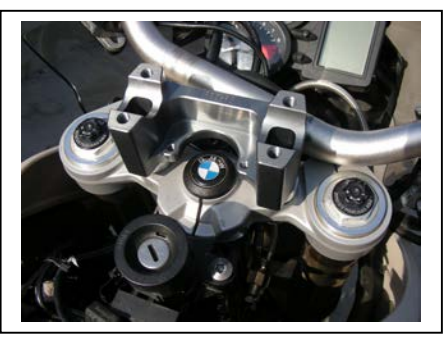
Lay bars forward out of the way & install Sub mount as shown