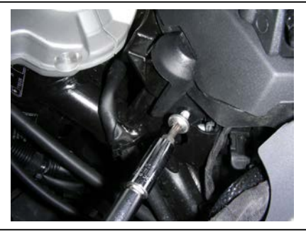
Remove the plastic torx key bolts