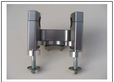
Sub mount/bushings/nuts & washers Installs as shown above