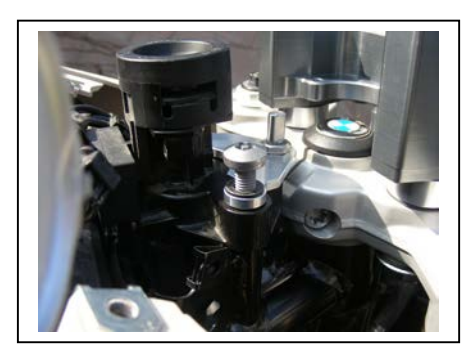
Frame bracket mounts as shown under the stock key mount bolts