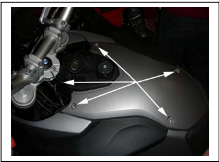
Remove the stock tank shroud bolts