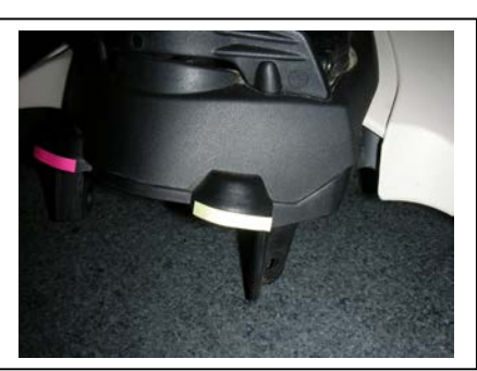
Tape marks where trimming occurs