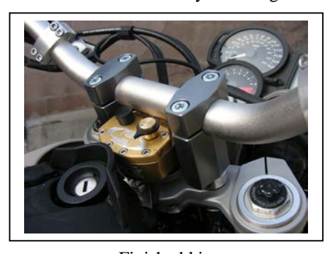
Finished kit 10/1/2014 BMW 6504-27