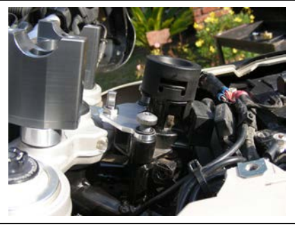
Side view of Sub & Frame bracket Spacers go under sub mount