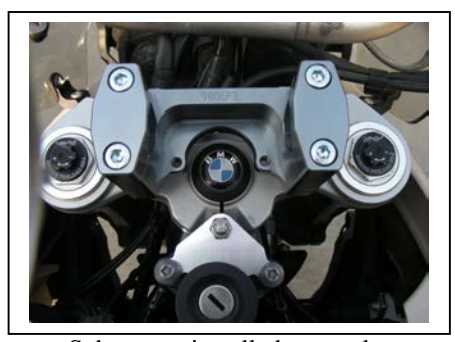
Sub mount installed correctly