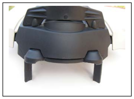
Trim here until this fits properly