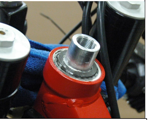
File any welds that keep the frame bracket from clamping tightly around head tube