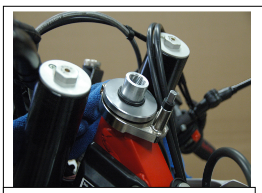
Install the Frame bracket first, then the new bearing shroud seal and finally the o-ring.