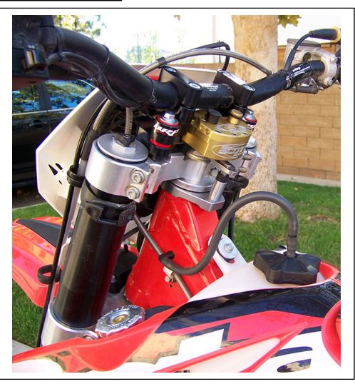
BETA instructions.doc 5825