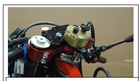
Install the stabilizer to the Sub mnt base