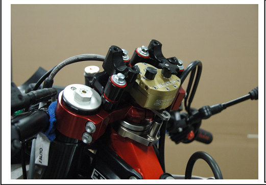
Install the upper half of the rubber sub mount to the base plate using the additional instructions provided to show that assembly in detail. Install the cable guide as per the photo below left.