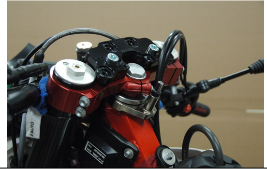
Install the base of the sub mount to the rear set of holes on 2 holes triple clamps and middle holes on 3 hole triple clamps