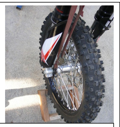
Block the front wheel & forks