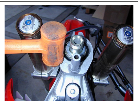
Tap bracket down until securely flush