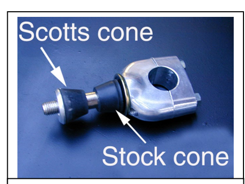
This shows the stock mounting perch