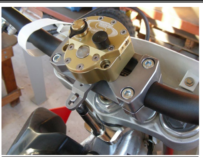
Shown here is the oversized bar kit with the stabilizer in the 'standard' mounting position, which eliminates the crossbar.