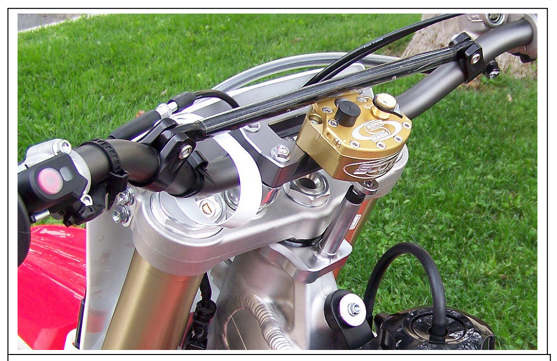
Finished kit installed using the stock handlebars with the stabilizer in the "reversed" position