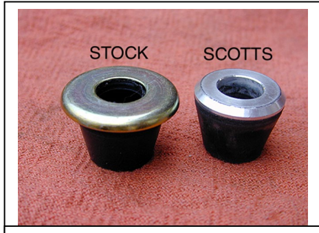
Use our replacement cones on the bottom